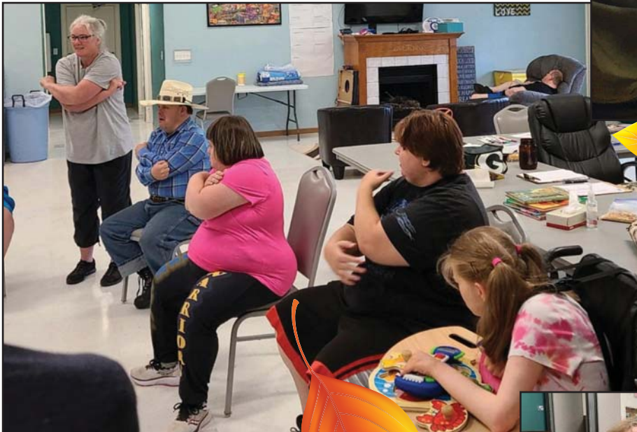
Stretching exercise in Cameron