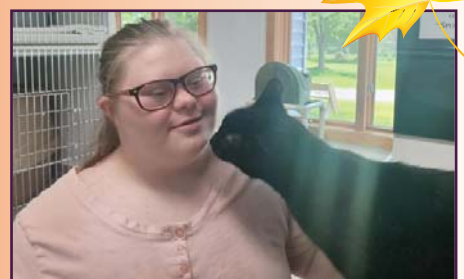
Volunteering at the Sawyer County Humane Society