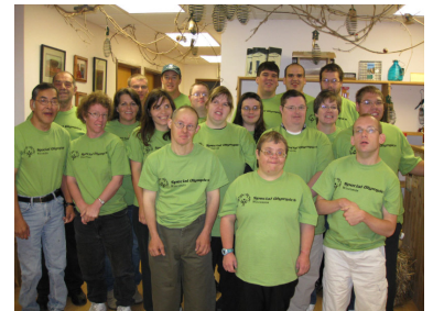
Ventures Athletics Bowling Team