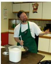
Mixing and Stirring