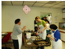
Rolling out balls and decorating