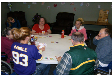
Lower: A group playing a card game in Rice Lake.