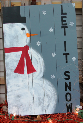
Examples of Pallets that have been painted by the clients and staff of Ventures in Cameron