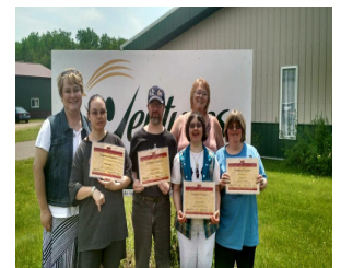
Recent Graduates of the Community Education class. Congrats!!!