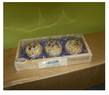
Just for the Birds is again starting up its suet production at full steam. We con-

tinue to supply local businesses as well as some folks in Minnesota. We are working hard to increase our wholesale business and get our products out to as many customers as possible. Last year we introduced some new items. In the suet line we offer "Tweety Pies" and "Suet