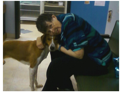
Spooner S.E.E.D. favorite past time, visiting the animals at the Washburn County Humane Society